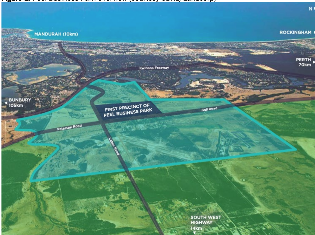
Figure 1: Peel Business Park Overview

Approximate geographic boundaries for PBP and the first precinct are outlined in Figure 1 below.